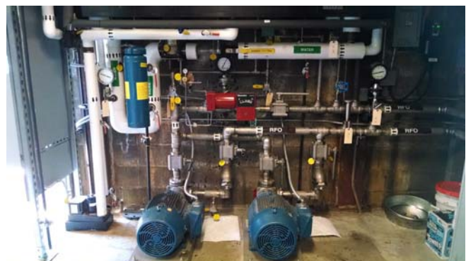
RFO Pump and Heat Exchangers

A separate stainless steel fuel circulation system was installed for the circulation and delivery of RFO to the burners. Due to space limitations at Memorial Hospital, the pump system was built on-site, but is usually provided as a standard skid mounted system.