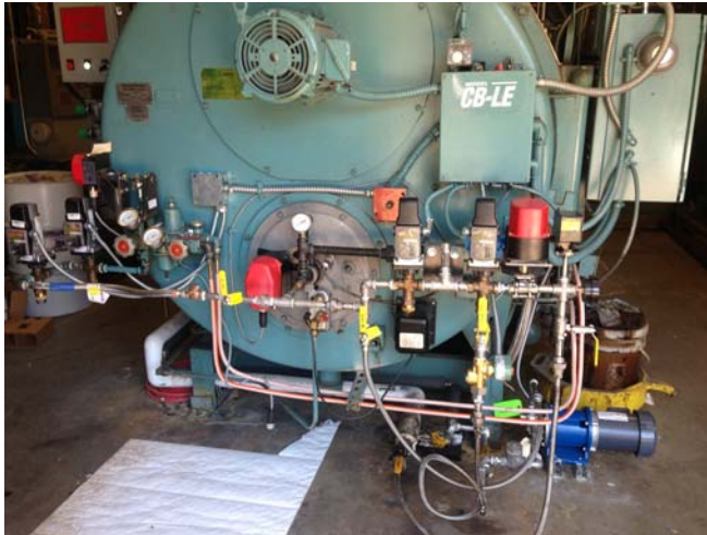
The Dual-Fuel Burner that can Burn both RFO and #4 Oil

In most cases, a boiler that burns fuel oil, natural gas or propane can be converted to burn RFO. For the installation at Memorial Hospital, Cleaver Brooks designed a drop-in burner that fit seamlessly with the boiler. This burner is capable of burning both RFO and #4 fuel oil giving Memorial Hospital a fuel redundancy that did not exist prior to the conversion to RFO.