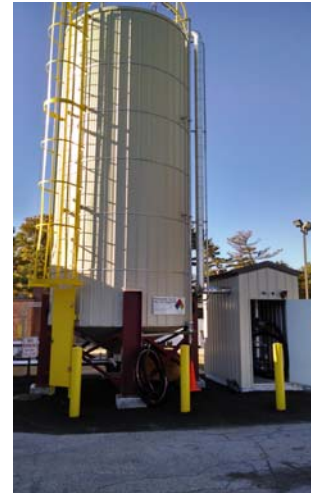
15,000 gallon storage tank